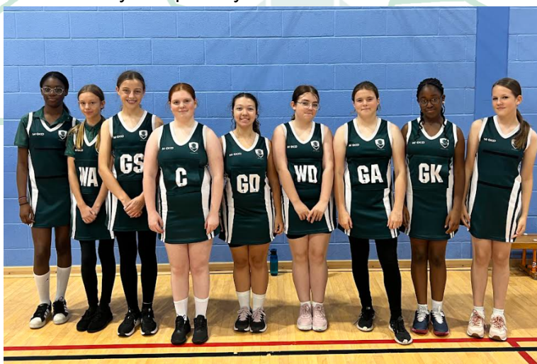
Year 9 Netballers looking professional in their new netball kit

Congratulations to all students who took part in the girls' Y7-10 netball fixtures against St Bede's last week and our boys' rugby fixture against Oasis Brightstowe this week. All students represented the school brilliantly and proudly.